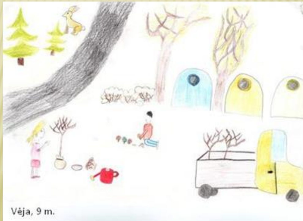
Véja, 9 m.

They decided to pick up all the litter and recuperate it. The rest couldn't disagree with this. During the following day the children brought bags and other items that were useful in order to clean all the mess. After completing their good deeds they walked to the empty rubbish containers and threw all the recuperated litter away. After several hours the children were sitting in their classroom, and their teacher Manuel was extremely proud of his pupils.