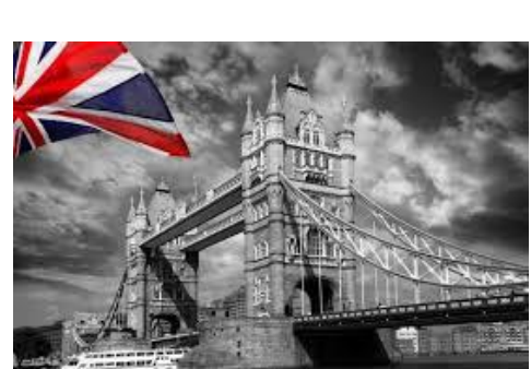
Dialling code for Britain: +44.