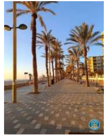
Paseo Playa San Juan