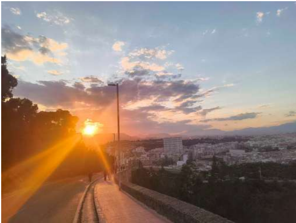
Un puesto de sol hermoso 😊

We also explored the Santa María Church and the old Ferrisa Gate. A very important part of our day was learning about accessibility. We searched for wheelchair ramps and discussed how to make the city better for everyone. From the "Cara del Moro" to the sea port, we discovered many secrets. It was a perfect day!”