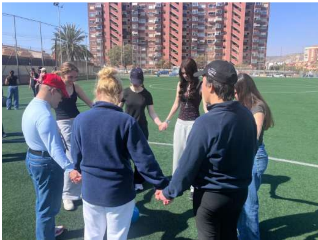
Meditations- und Verbundenheitskreis

Las Paralimpadas – dieser Tag widmete sich der Inklusion. Verschiedene Inklusionsaktivitäten wurden zur Bewusstseinsmachung der Inklusion von Personen mit Beeinträchtigungen durchgeführt.