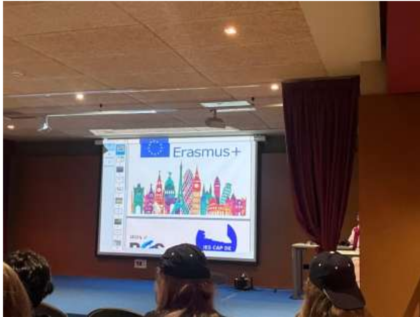
Präsentationen von den Schülerinnen und Schülern der IES Cabo de la Huerta