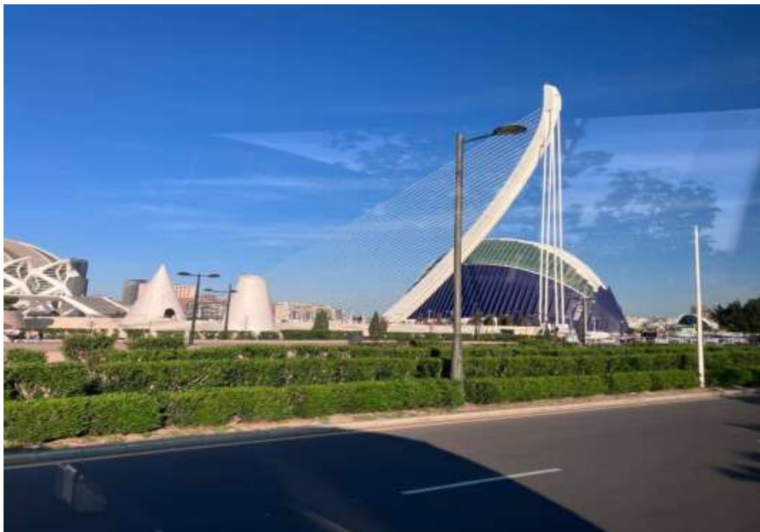
Ciudad de las Artes y las Ciencias en Valencia