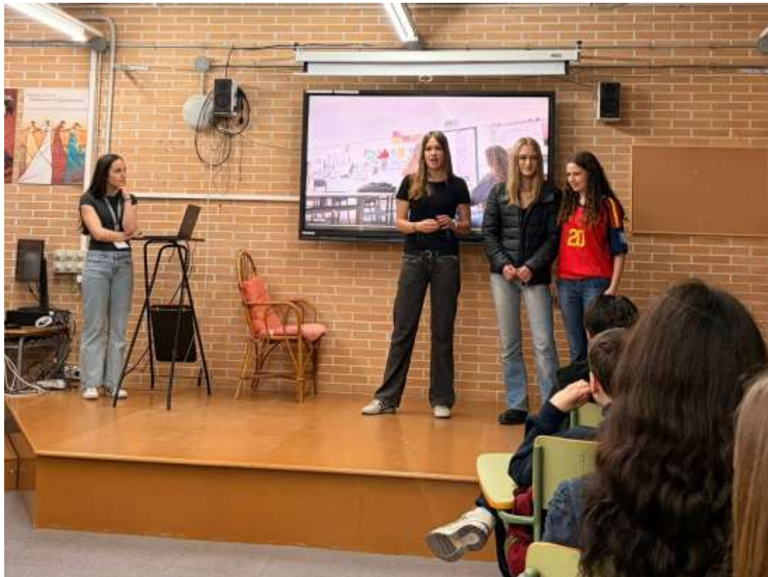
Unsere hervorragende drei Oberstufenschülerinnen 😊 beim Präsentieren