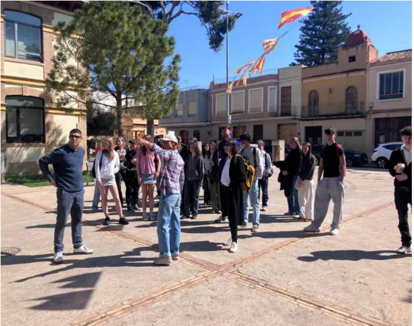
Our guided tour through a town devastated by the natural disaster “DANA” in October 2024