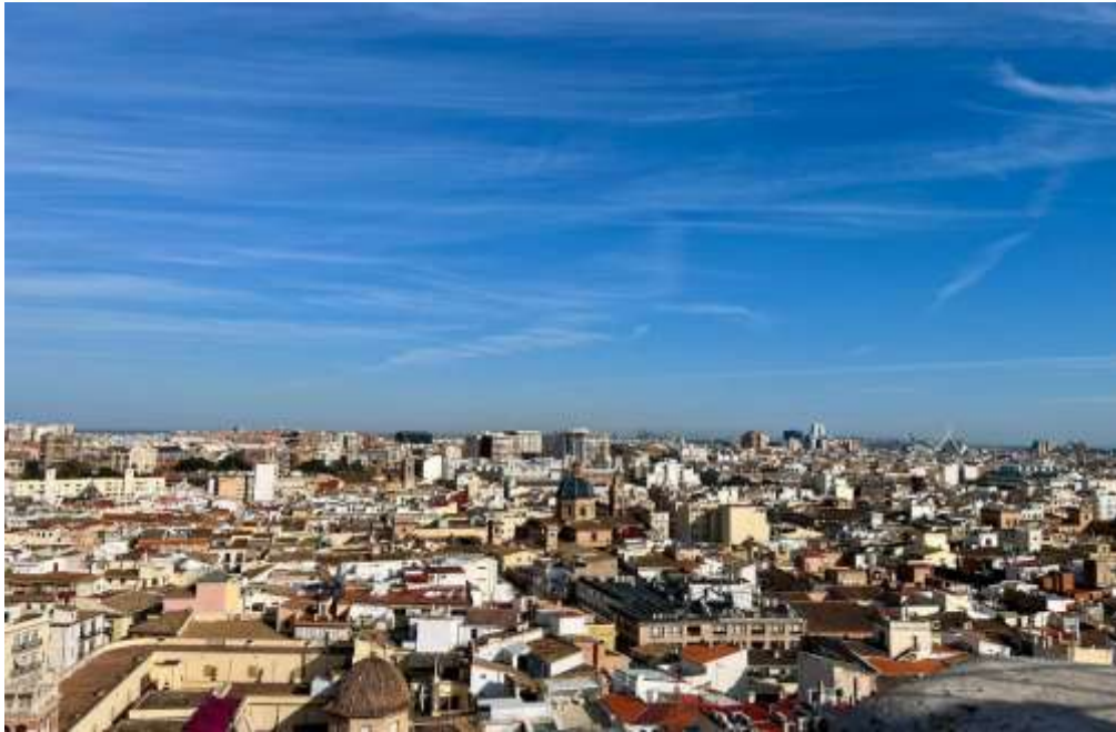
Ausblick von oben der Kirche-Turm auf Valencia Stadt.