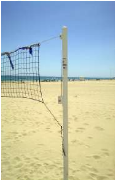
Beach-Volley Platz Am "Playa San Juan"