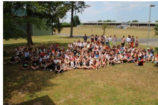
All the pupils from the 8 participating classes with around the 5 english students

The students of Alderley Edge school in England have also taken part in this project, reading two of the selected books. This year the topic was the first World War. The two books read commonly by the French and the English students were "Soldier Peaceful" and "War Horse" written by Michael Morpurgo. The reading competition final took place in June in Saint-Jacques de Compostelle ,gathering the French and the English students who had come to France.