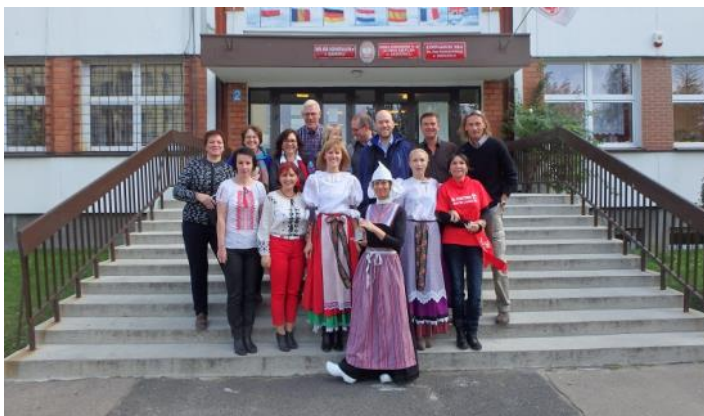
Picture of the coordinators meeting Poland October 2015

This newsletter will be regularly published to make you be aware of what is going on or what took place in the several partners. schools until 2017.