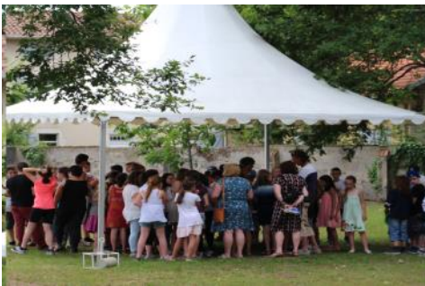
The finale of the reading contest