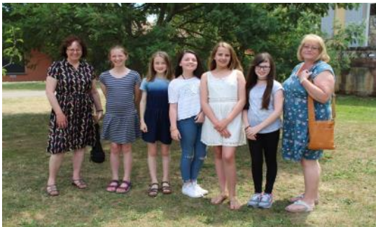
English pupils and their teachers

This bilingual booklet, entitled " the War Though Our Eyes" compiles the work from the various classes over the year, as well as the work on researches, information editing, translation and layout, carried out with the help of English pupils from an exchange program in June 2015.