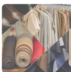
Developing and Implementing amenities for sustainable TCLF industries