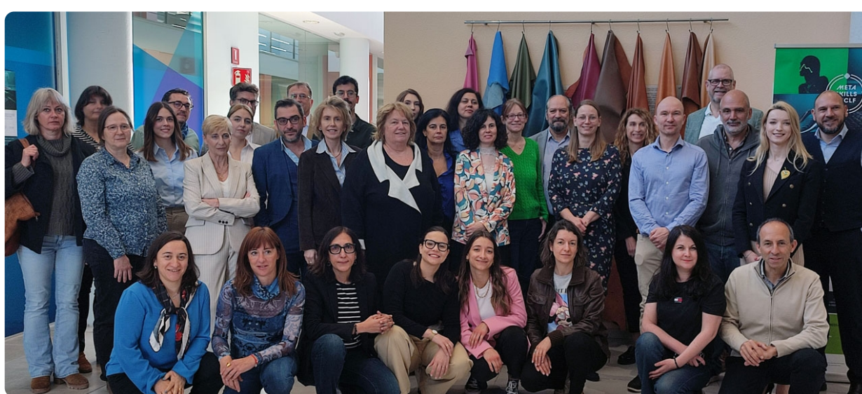
2 nd meeting, Igualada, Spain