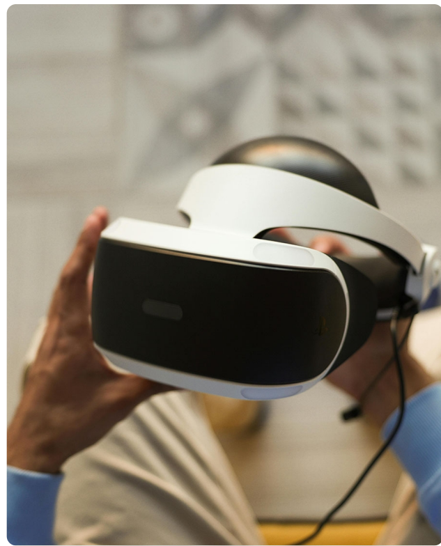
Metaverse: Advantages of the Player Mode in the Project read more