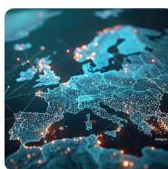
An industry in flux, sustainability and nearshoring