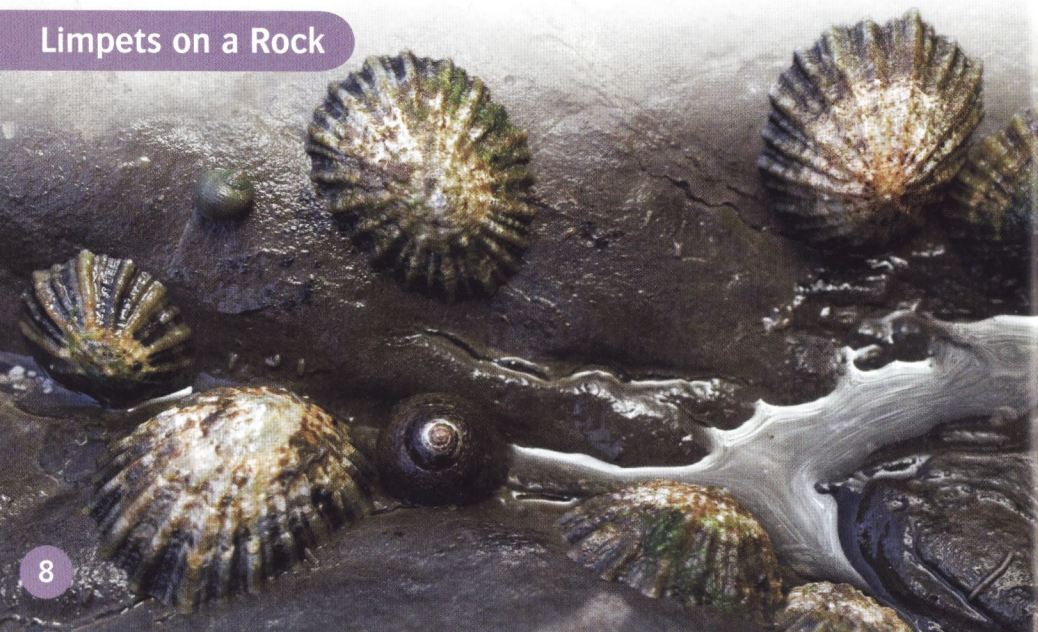
Limpets on a Rock

Limpets are animals that have a special strong foot that holds onto rocks. This keeps them safe from big waves. They also have a hard shell so they don't dry out.