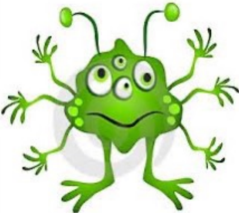
Label the Alien