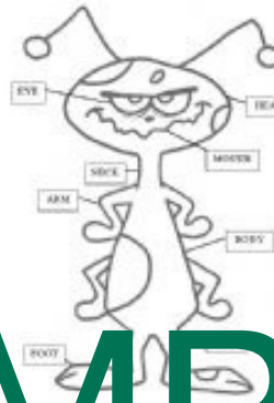
A Very Colourful Alien