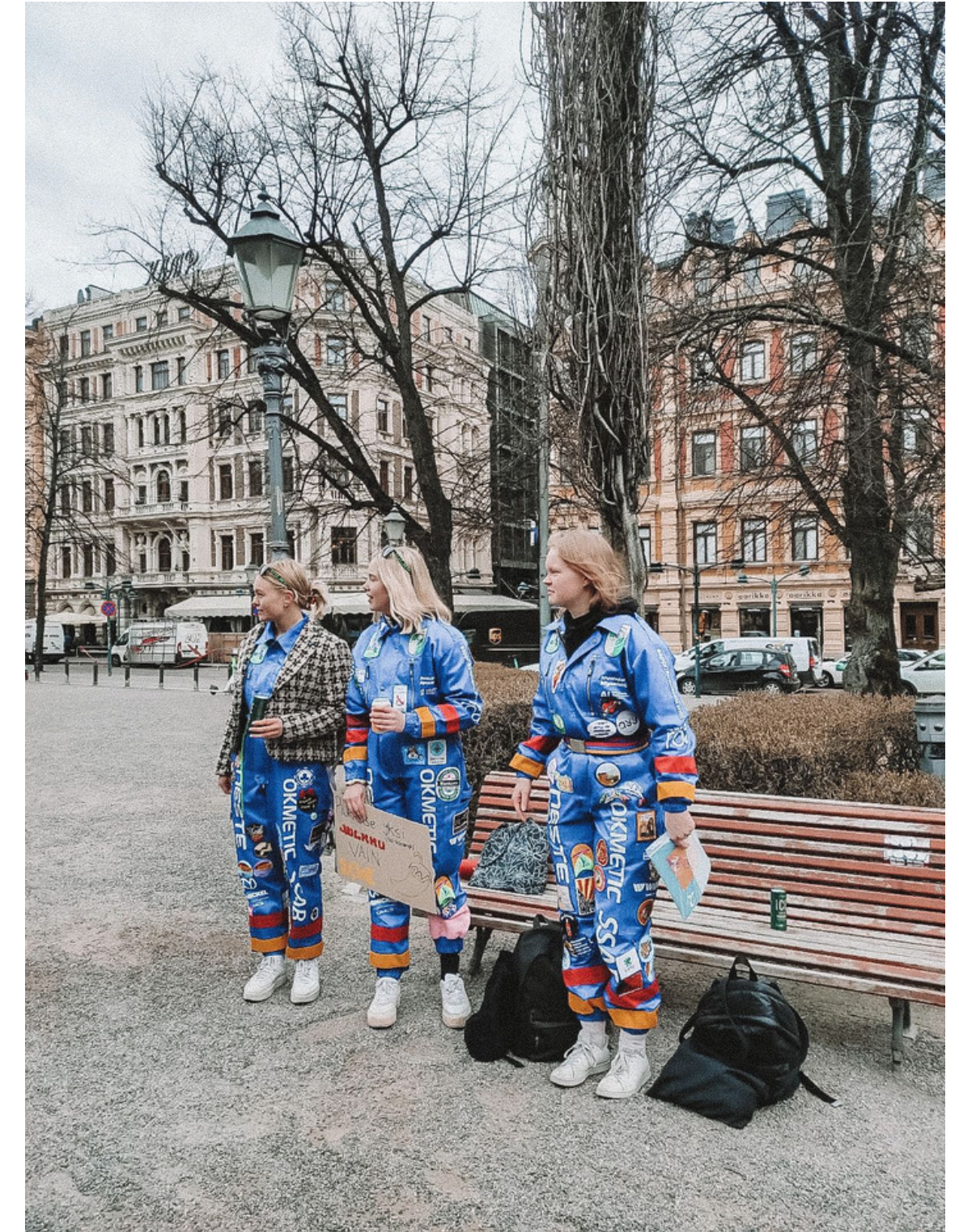
AUTONOMY, INDEPENDENCE AND TRUST