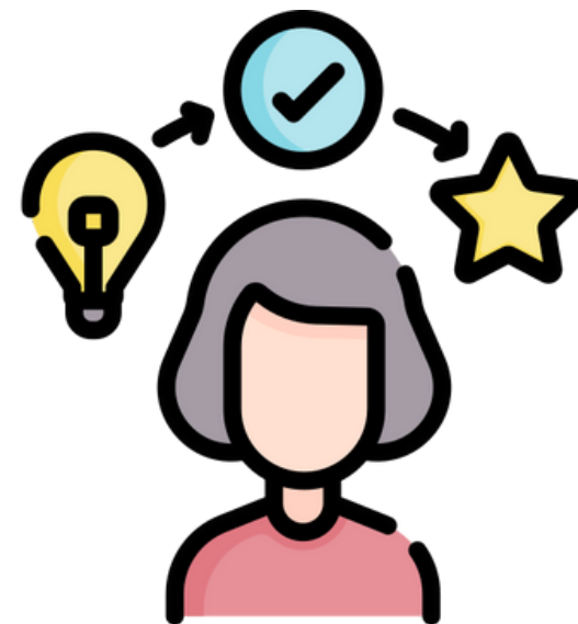
PARTICIPATION & IMPLICATION