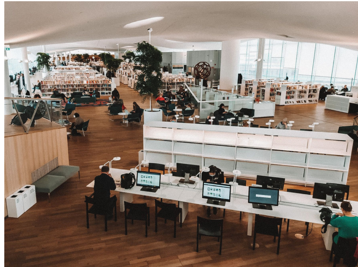
EDUCATION FOCUSED SOCIETY