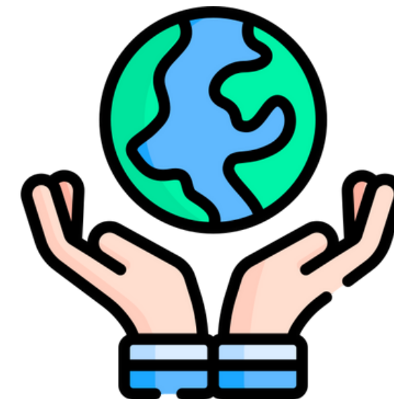
REAL CONTEXT LEARNING